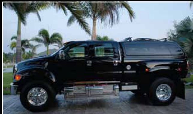
F-650 EXTREME 4X2 4 DOOR