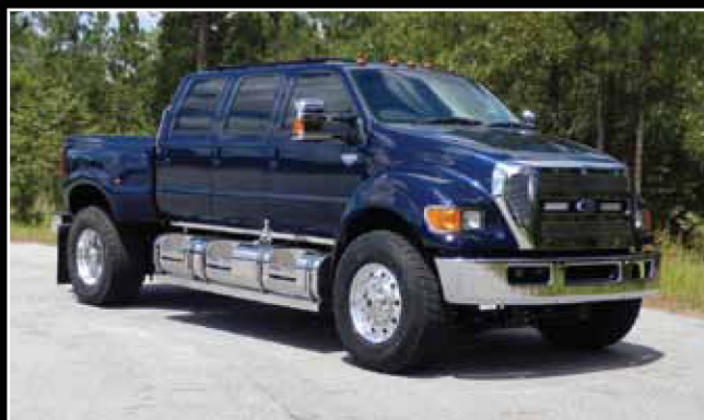
F-650 EXTREME 6 DOOR