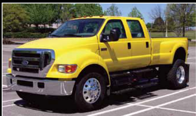
F-650 XLT CREW CAB 4X2 4 DOOR