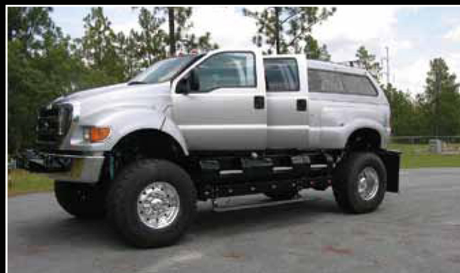
F-650 EXTREME 4X4 4 DOOR